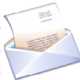
KS3 pupils have been making pen friends in France and Germany.